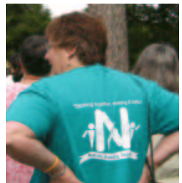
The t-shirt says, Sticking together, making it better Nurses Banding Together