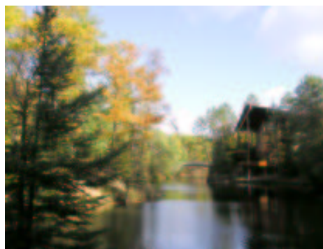
The Lodge at Black Lake

All in all, it was a very nice, informative luncheon. We wish to thank our entire membership for making wonderful opportunities like this possible.