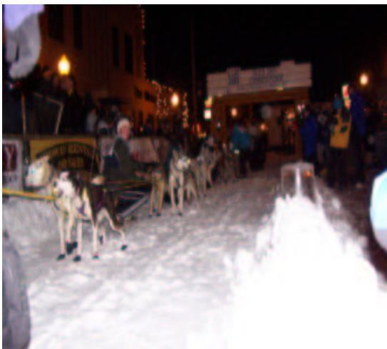
The race starts in downtown Marquette

We have a board member and a snowmobile club that helps with keeping the trail packed and safe from debris. Last year we had over 600 volunteers that put their time and energy in to making it one of the safest and fastest races we have ever had. We also have the Closing Ceremonies in Mattson Lower Park where the top five mushers come with their lead dog and talk to the crowds about their adventures and to receive their winnings. It is a great time for all. Without the volunteers we couldn't do it. We are grateful every ounce of energy they give us. There are many volunteers that come from all over the United States and that definitely speaks volumes for this race.